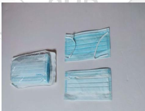
Photo of Samples